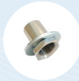
710206 – Extension nut to be used on AllDisc with long screw enabling installation thickness 25-50mm