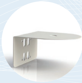
710452 – AllDisc bracket